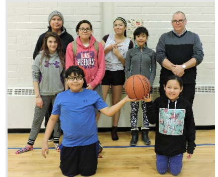
Milo students attend the Arrowwood Basketball Tournament in March