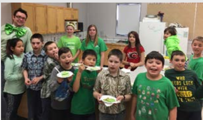
Green Pancakes on St. Patrick's Day, thank you student leadership teams!