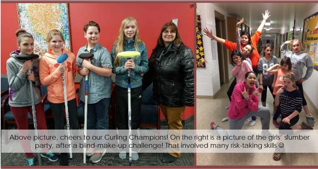
Above picture, cheers to our Curling Champions! On the right is a picture of the girls' slumber party, after a blind-make-up challenge! That involved many risk-taking skills ☺